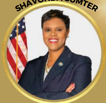
ASSEMBLYWOMAN NEW JERSEY GENERAL ASSEMBLY 35TH LEGISLATIVE DISTRICT