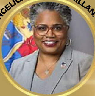
GOVERNORS CABINET MEMBER STATE BOARD OF EDUCATION SECRETARY