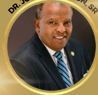
IOM FOUNDER, PRESIDENT & CEO AACCNJ