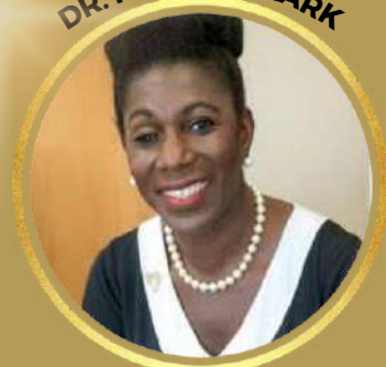
PRESIDENT & CHIEF EXECUTIVE OFFICER NEWARK COMMUNITY HEALTH CENTERS, INC.